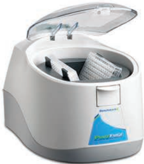
PLATE FUGE™ MICROPLATE MICROCENTRIFUGE