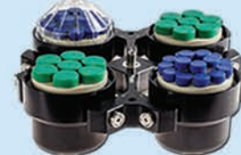
Tissue Culture Bundle