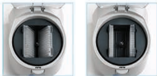
Before/After Centrifugation During Centrifugation

C2000 PlateFuge™ Microplate Microcentrifuge $894