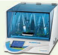
Item: H2010 & H2012 (Cooling)